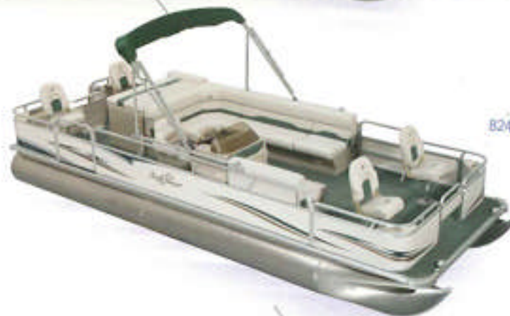
8524 4.0 FISH

All boats using OBs greater than 125 H.P. should have dual or hydraulic steering.