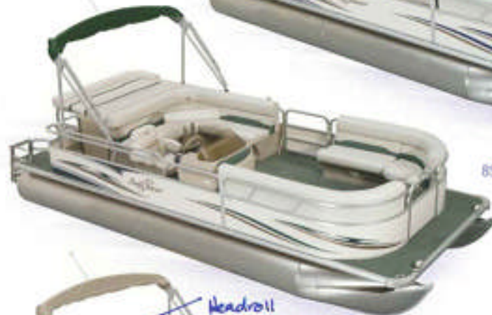
8522 CRUISE RE