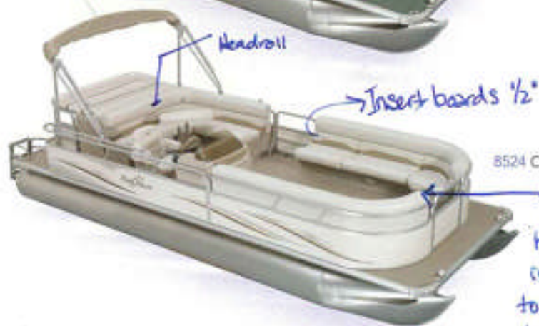
8524 CRUISE RE