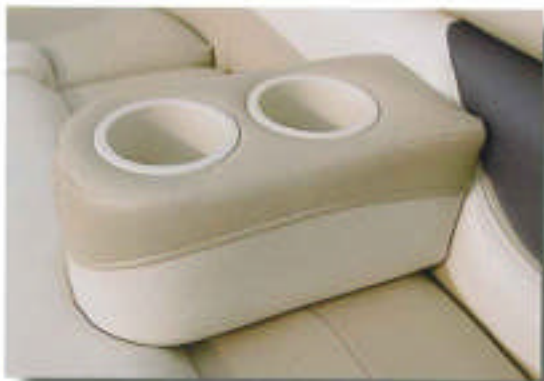
The cruise models offer the versatility of these movable cup holders.