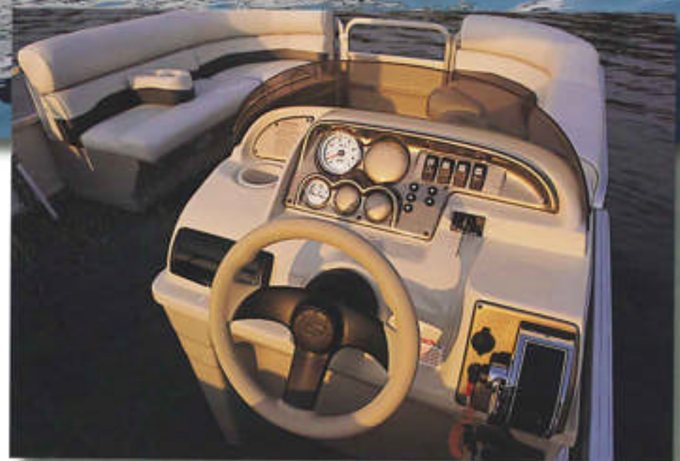
At the helm, you'll enjoy the comfort of our custom-molded console with easy-to-read gauges, a CD player and a windscreen.