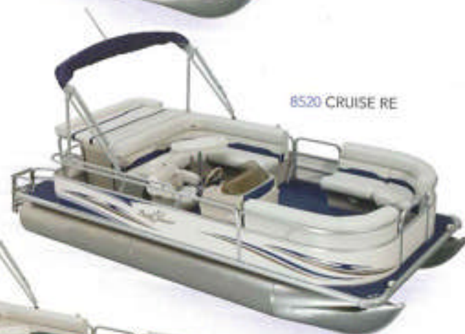
8520 CRUISE RE